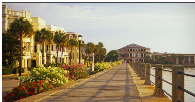
Charleston, South Carolina

Part of the excitement of family history work is "getting your hands dirty" with stories, census records, deeds, birth certificates, passport applications and more. Not coincidentally, there's a group based in the Charleston, South Carolina area that brings a whole new meaning to the phrase - it's D.I.R.T. - aka "Digging Into Roots Together".