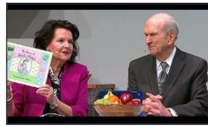
Gather Israel on Both Sides of the Veil