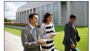
Take Ancestors to the Temple